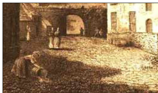
Street during the Siege