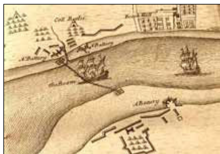
Breaking the Boom

The Siege of Londonderry was a pivotal point in world history. The defence of that city and the events surrounding it marked the end of the era of absolutist Monarchy and bolstered the fledging concept of Parliamentary Democracy. Its story is fascinating.